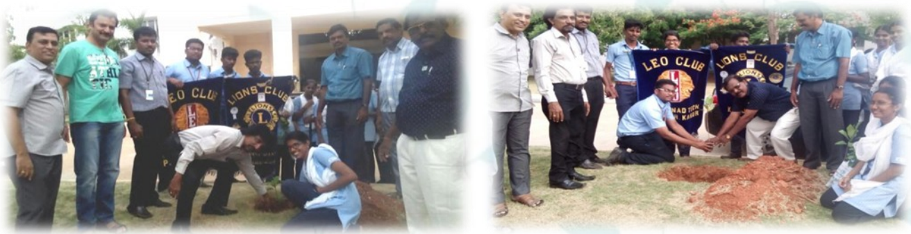
Chief guests planting the saplings at the inauguration of Leo Club on Kamarajar Jayanthi