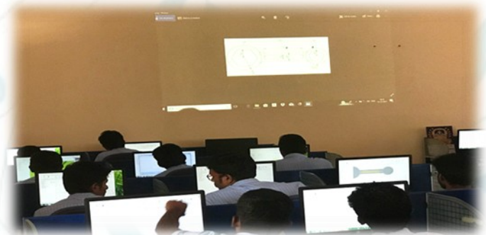
Mechanical engineering students attending Auto Cad and Creo training course