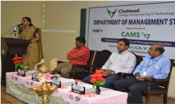
Principal's presidential address