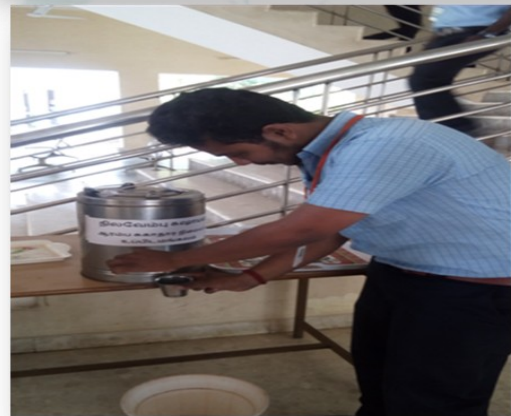
Students drinking Nilavembu Kasayam