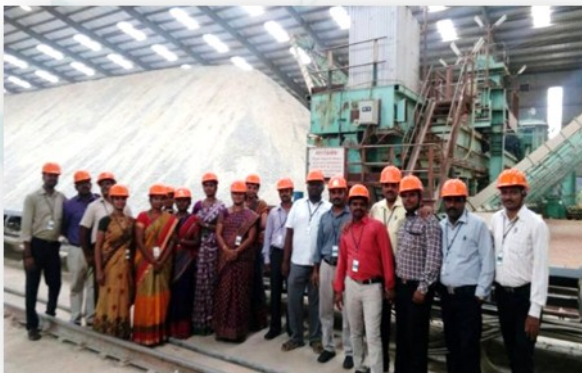
Faculty members at Chettinad Cement Corporation Ltd., Puliur

17 staff members from different departments of Chettinad Tech were trained at Chettinad Cement Corporation Ltd., Puliur from 08.06.2017 to 09.06.2017.