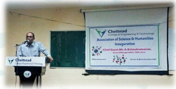
Chief Guest addressing the gathering