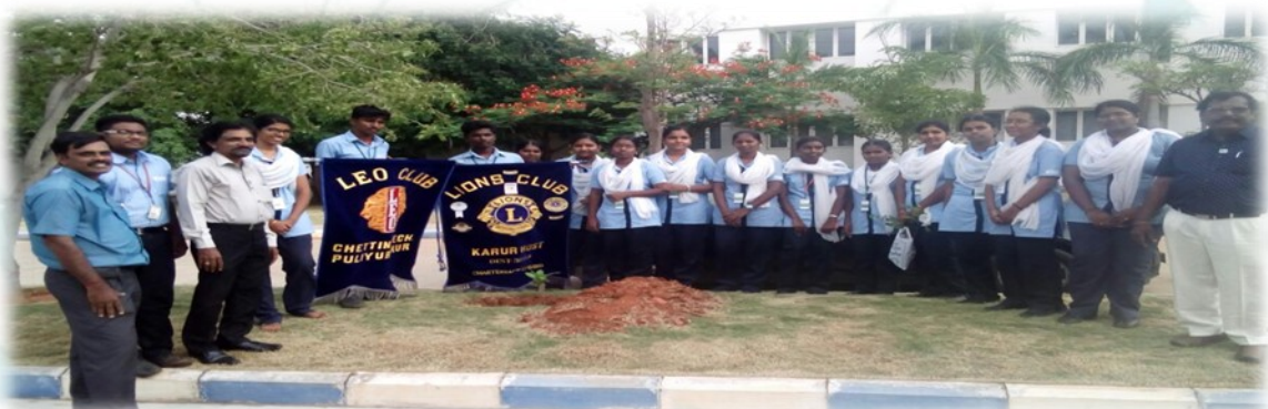
Leo Club members and the chief guest at the club inauguration