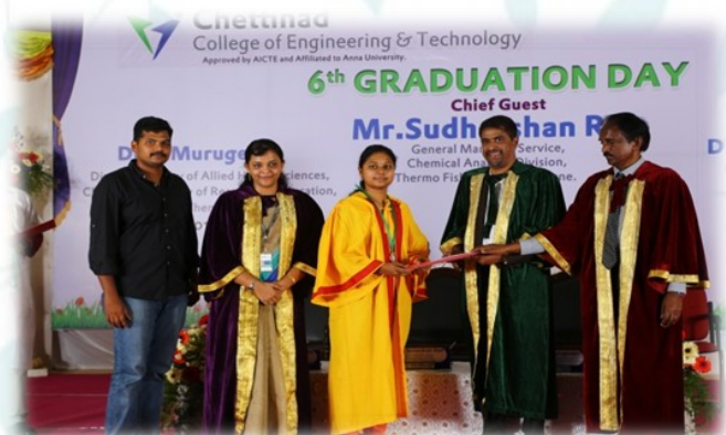
Distribution of degrees on graduation day