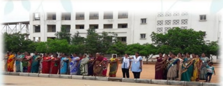
Staff and students taking pledge