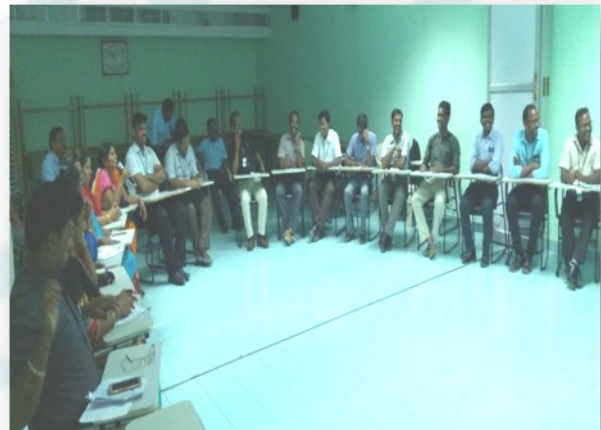
Faculty interaction during the training program