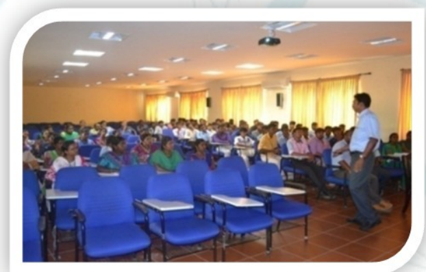
Chief guest interacting with the students