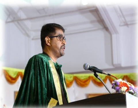
Chief guest's graduation day address