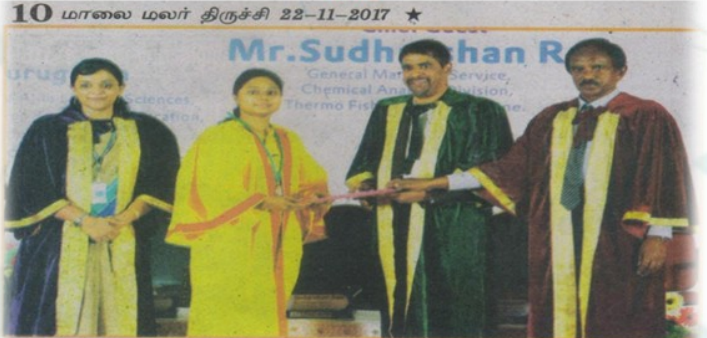
செட்டிநாடு பொறியியல் மற்றும் தொழில்நுட்ப கல்லூரியில் பட்டமளிப்பு விழா நடைபெற்றபோது எடுத்தபடம்.