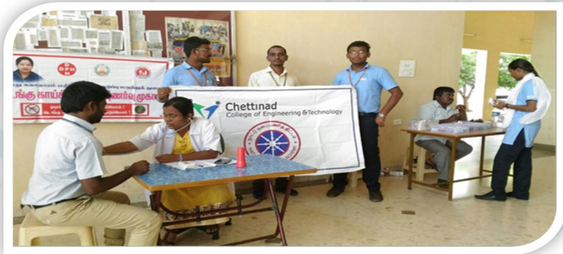
Medical checkup by the doctor from Uppidamangalam Primary Health Centre

The social club conducted a medical camp on August 14 th inside the college premises. Many students and staff members participated in a voluntary health checkup.