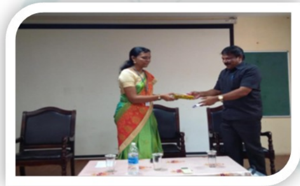
Principal honoring the chief guest