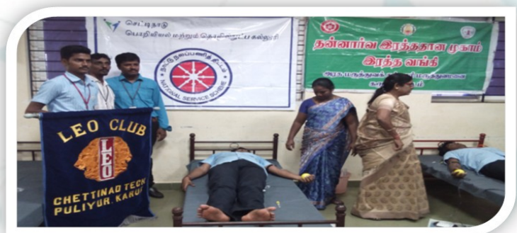
Students donating blood during the camp

The Leo Club, NSS and Rotaract Club of Chettinad Tech joined hands with the blood bank of Government Medical College, Karur and Primary Health Centre, Uppidamangalam and conducted a blood donation camp on 12.08.2017 .