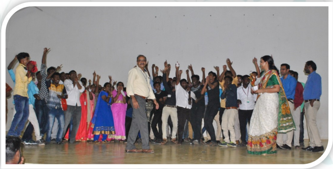
Photo Gallery of VYUHAA'17