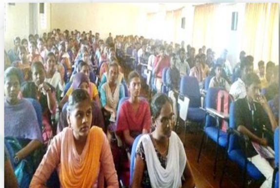
Students involvement at the orientation program