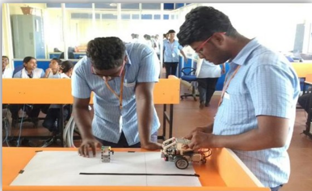
Active participation of ECE students in robotics

A robotics course intended for III and IV year ECE students was conducted between 28.06.2017 to 01.07.2017 by a resource person from Global Robotic Academy, Erode to familiarize the students with the basics of robotics.