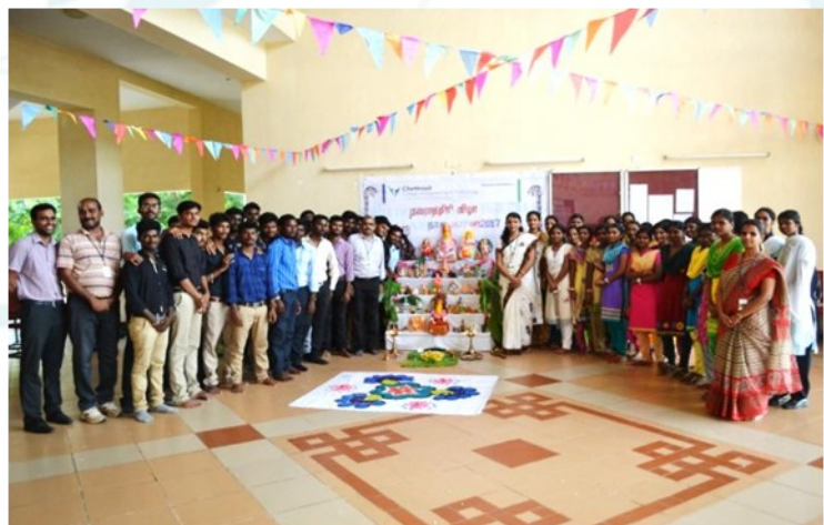
Students and staff at the Navarathiri celebration