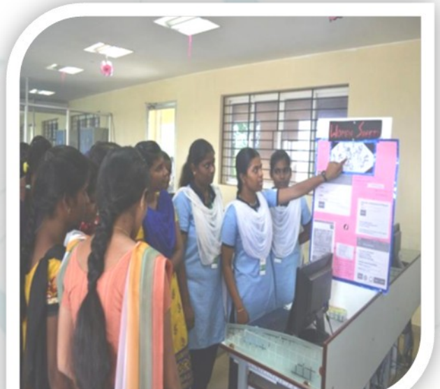
Students explaining the project applications