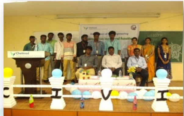
Chief guest and Geo Designers' association members