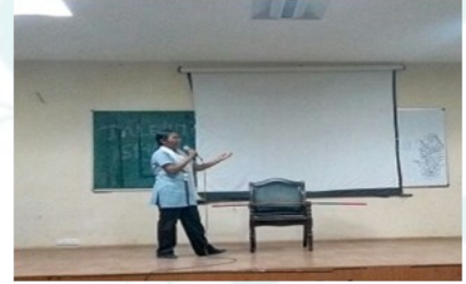
Student's performance at the talent show