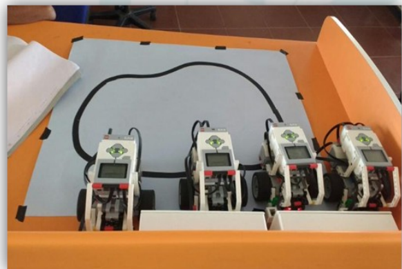
Robotic kits displayed during the course