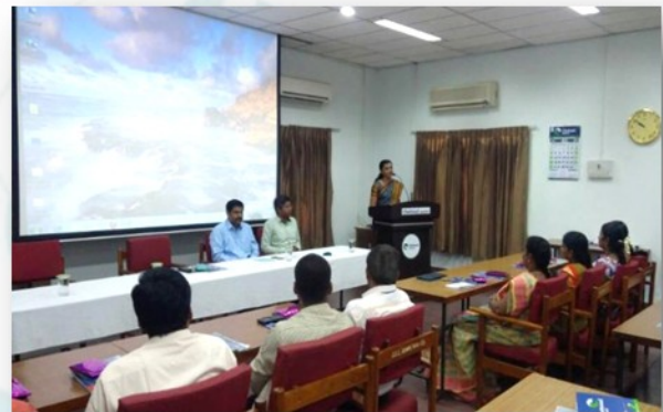
Principal's feedback about the training session