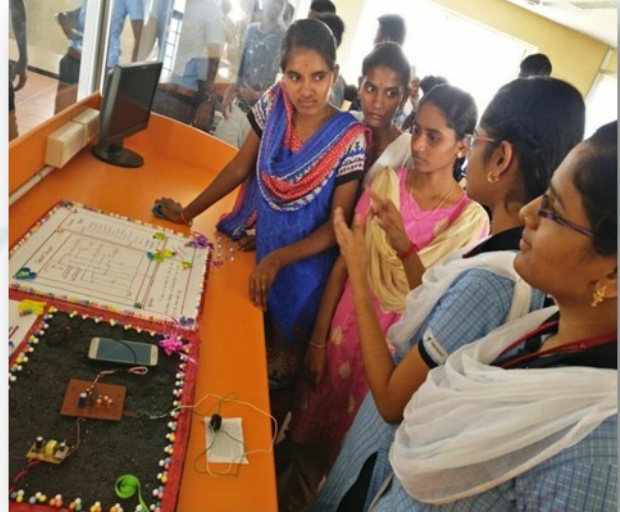
Students exhibiting and explaining the functions of the projects