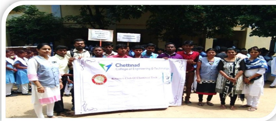
Chettinad Tech, Rotaract volunteers at the rally