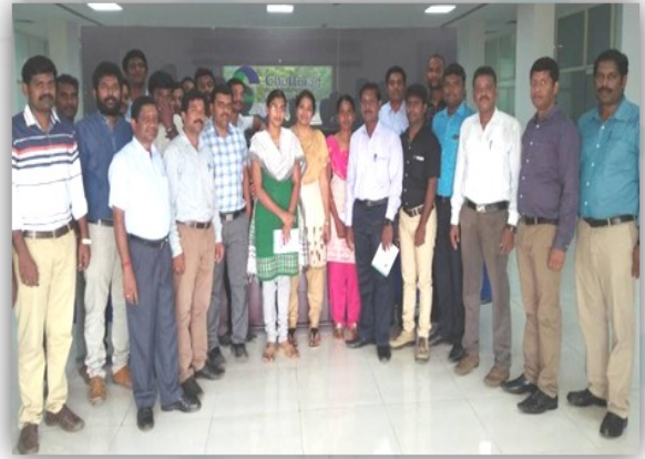
The faculty and the staff of Chettinad Cement Corporation Limited, Ariyalur seen during the faculty training program

Chettinad Cement Corporation Ltd., Karikkali gave training to 18 staff members from 08.06.2017 to 09.06.2017.