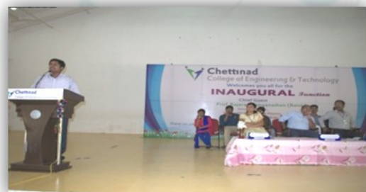
Alumnus sharing his experience with the freshers