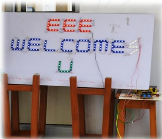
Welcoming project of EEE

The two projects named ' House Security Alarm ' and ' Electric Burner ' were selected as best among the 23 exhibited projects by the EEE & EIE department in the Mini Project Expo'17.