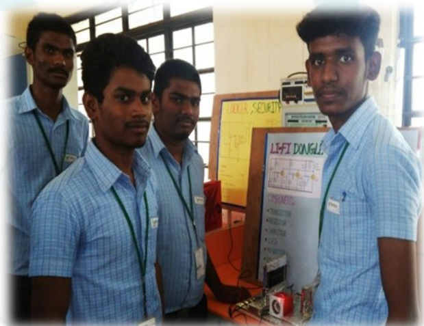
Students exhibiting the project