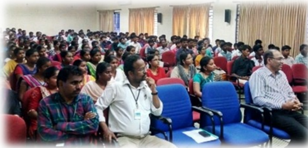
Staff and Students at the association inaugural