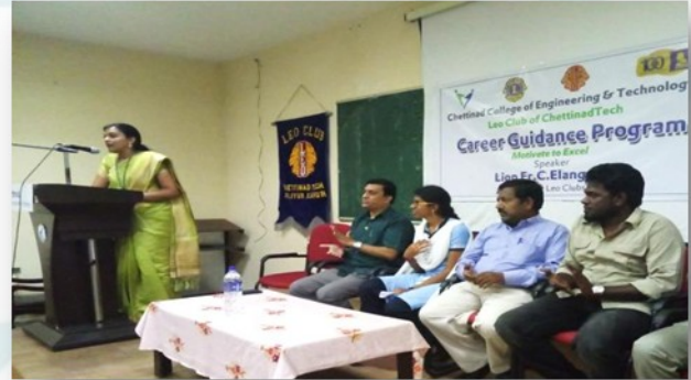
Principal delivered the welcome address