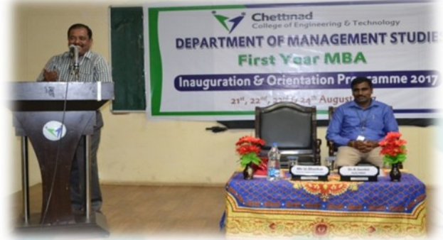
Chief guest addressing the gathering