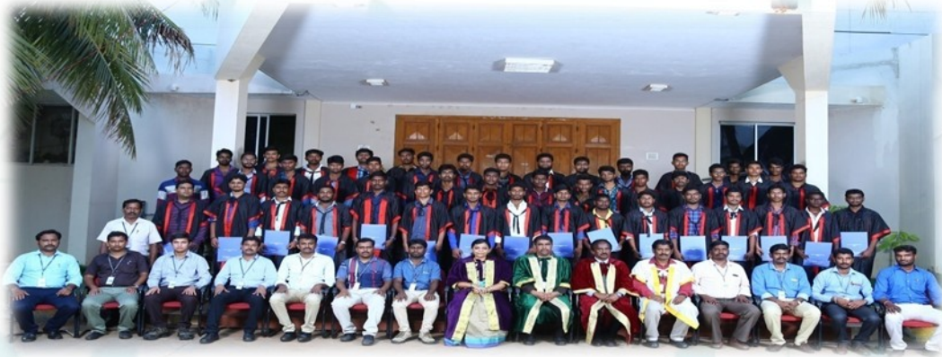
Batch two students of mechanical engineering on graduation day