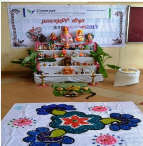
Display of idols at Kolu

The MBA department with the involvement of all the other departments celebrated Navarathri by performing songs and organizing cultural activities.