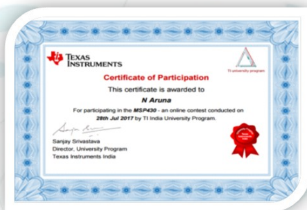
ECE Department-online certificate in the online contest conducted by Texas Instrument