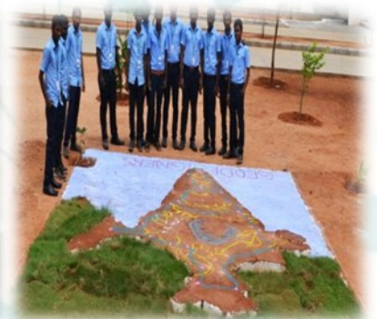
Civil engineering students' project display