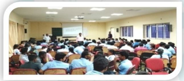
Placement training for the final and pre-final year students by the expert trainers on soft skills and aptitude