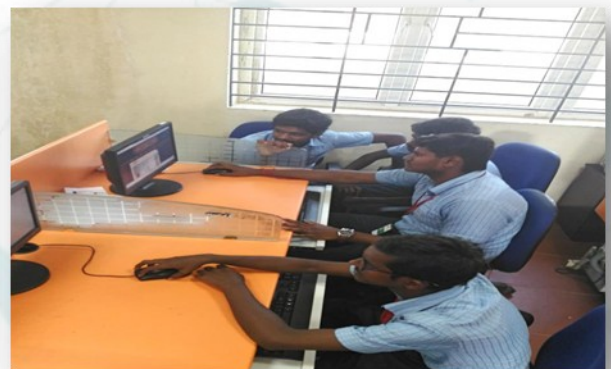
Computer Science engineering students participating in project contest