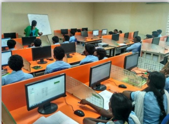
The resource persons handling the courses

The value added course on PIC micro controllers and FPGA was conducted for EEE students by the resource persons from Galwin Technology, Trichy. The course was arranged for four days from 28.06.2017 to 01.07.2017 to mould the technical skills of students.