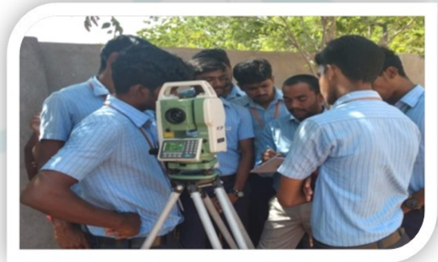
Final year and third year civil engineering students participating in the training program