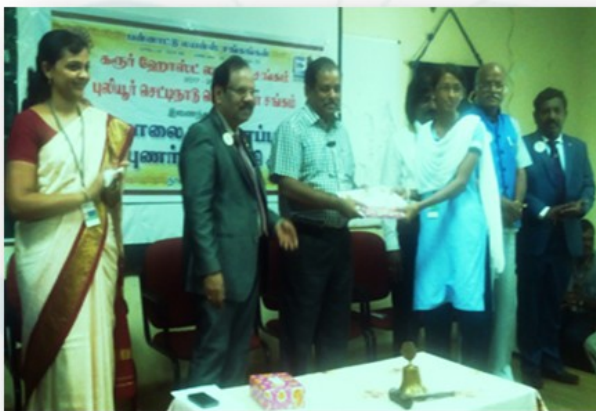
Chief guest distributing the certificates