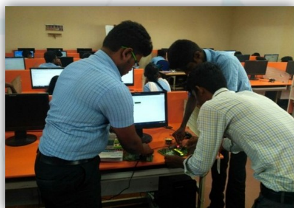
Active participation of the students