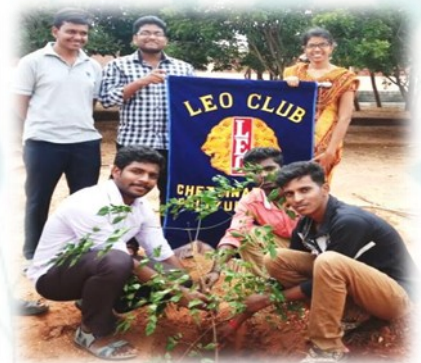
Tree saplings planted by students of Chettinad College inside the campus on Dr. Kalam Jayanthi