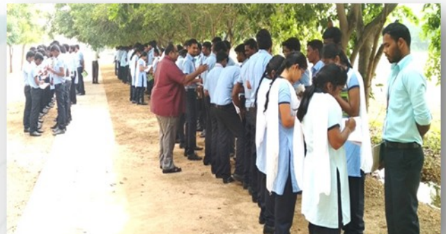
Outdoor training of soft skills