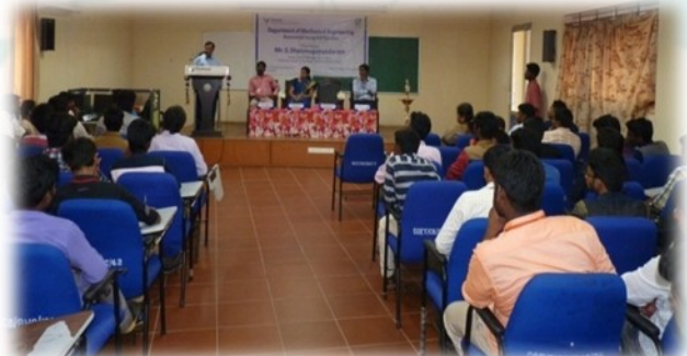
Chief guest addressing the MESA association engineers