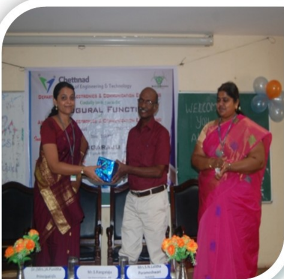
Principal honoring the Chief Guest with memento