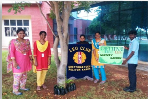
Students at the inauguration of the nursery garden