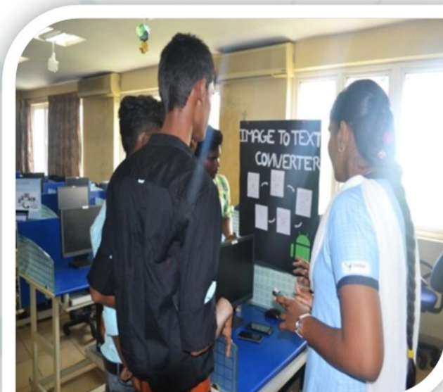
Students observing the project applications

'School Management System' and 'Smart Class Room' projects were adjudged as the best entries in the department of CSE & IT, among the 26 projects displayed.