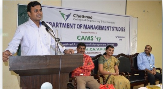
Chief guest delivering a special address